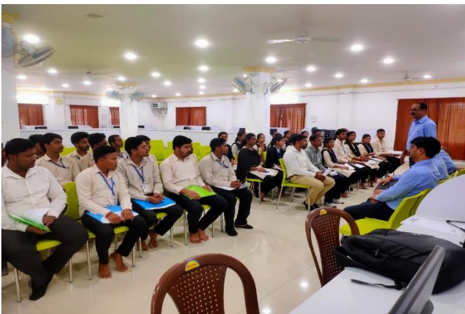
Recruitment drive by Jindal Steel and Power