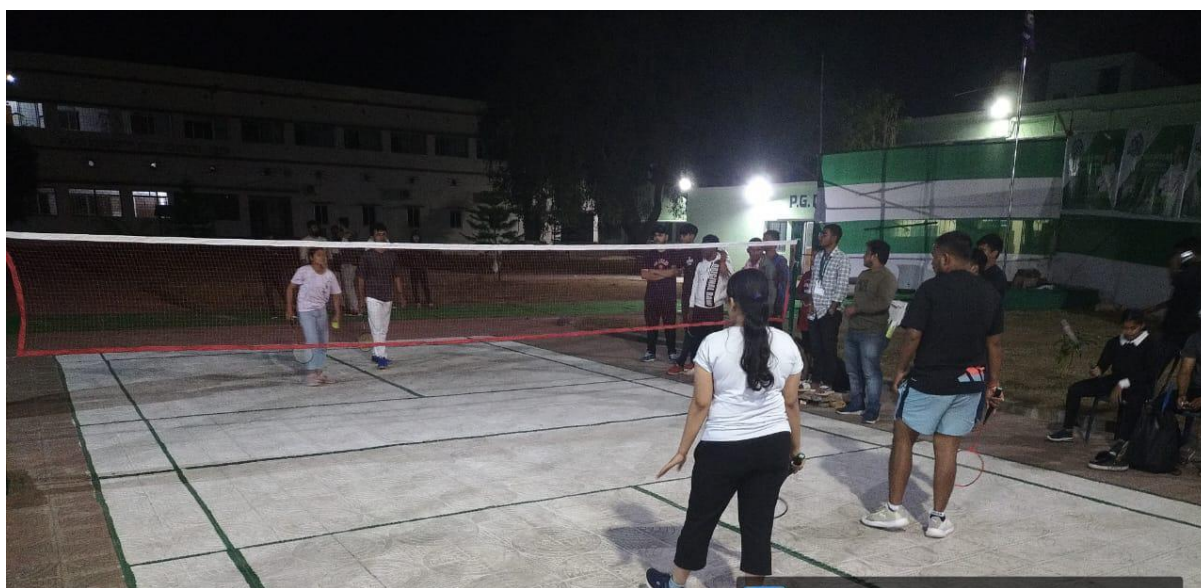
Mixed Doubles Badminton Match (part of IYDP)