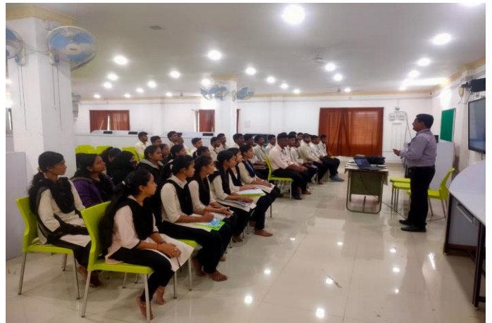
Recruitment Drive by HCL Tech