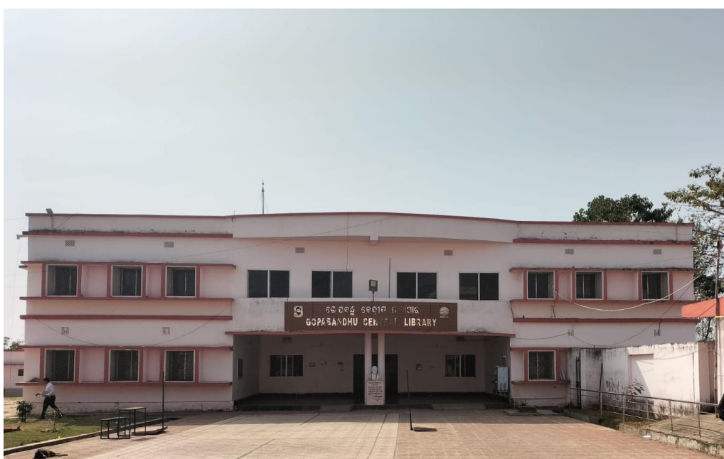
Gopabandhu Central Library and Computer Centre