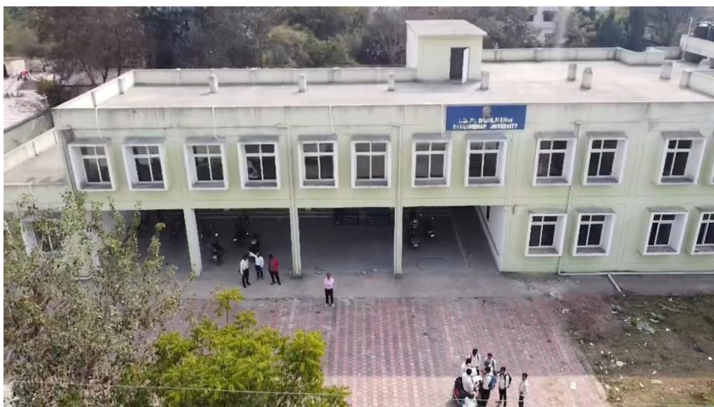
New Building constructed with financial support received from OHEPEE

From the non-civil head of Rs. 1.35 crores, class room furniture, office furniture, books for the University library and furniture for two 300-seated hostels, TV, CCTV Camera etc. were purchased. The surplus fund has been earmarked for the purpose of installation of computers in the newly constructed Central Computer Lab. Proposal has been submitted to the Department of Higher Education for accordance of necessary approval for utilisation of the accrued interest amount towards upgradation and renovation of a mini conference hall.