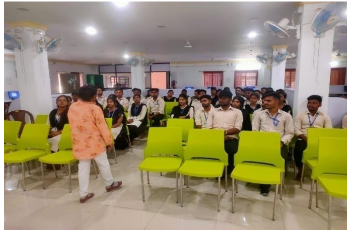
100 hours of training by TCS