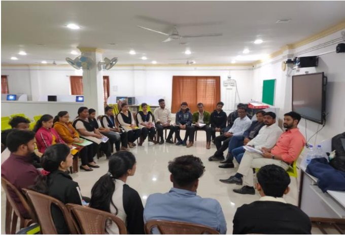
Recruitment drive organized by Tech